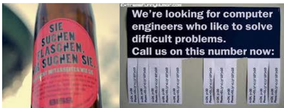
Picture 2. Examples of unconventional recruitment messages

The deeper deficit of specialists in the labour market causes employers to draw their attention more and more frequently to increasingly unusual forms such as scouting or guerilla recruiting. Scouting is the search for candidates in their natural environment (e.g. current work, shop, restaurant) when they are in their comfort zone 32 . Potential employees do not know that they are involved in the initial stage of the recruitment process, which allows them to behave naturally. This gives the recruiter better opportunities to know their strengths and weaknesses. Guerilla recruiting, in turn, involves unconventional forms of communication (such as spraying on the walls or organizing freestyle basketball events) to attract as many candidates as possible at relatively low cost 33 .