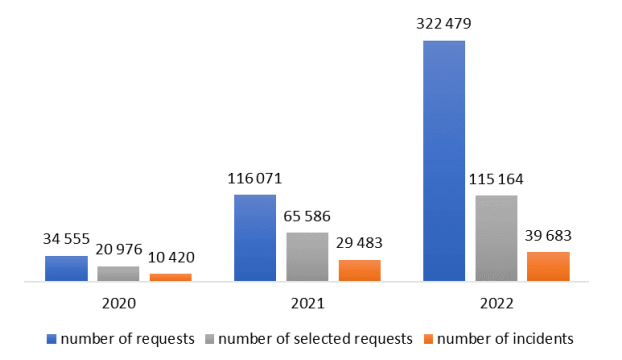
Figure 1. Numbers of requests, selected requests and incidents reported by CERT.PL

In 2021, CERT.PL recorded an increase in incidents handled at the level of 182% compared to the 2020 year. In 2022, the team observed an over 34% increase in registered cybersecurity incidents compared to the previous year. The increase in reports and cybersecurity incidents is certainly due to the growing awareness of the team. In 2022, a social campaign was launched on media that informed about the threats and how to report them. The most frequently reported type of incidents registered in the analyzed period were computer frauds, in particular phishing. Another type of incident that was frequently reported in the analyzed years was malware. The third type of incidents that occurred most often was abusive content (in 2020 and 2021), and intrusions (in 2022), e.g., burglaries to IT systems and e-mail accounts (Fig. 2). Table 3 presents data about information security incidents in the public administration in Poland in the surveyed years. The number of incidents in this sector has not exceeded 4%.