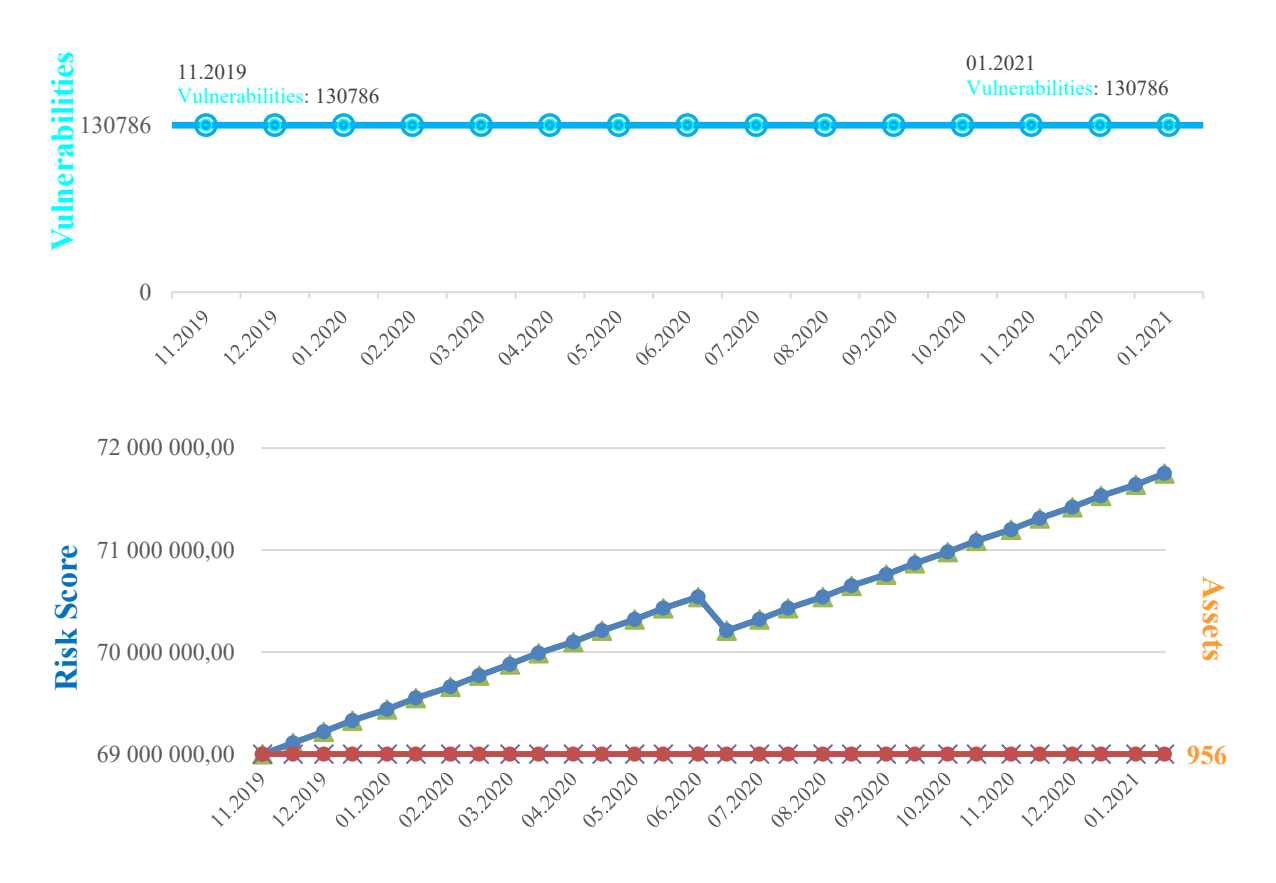
Figure 2. Change in the degree of threats to computer systems within one year.