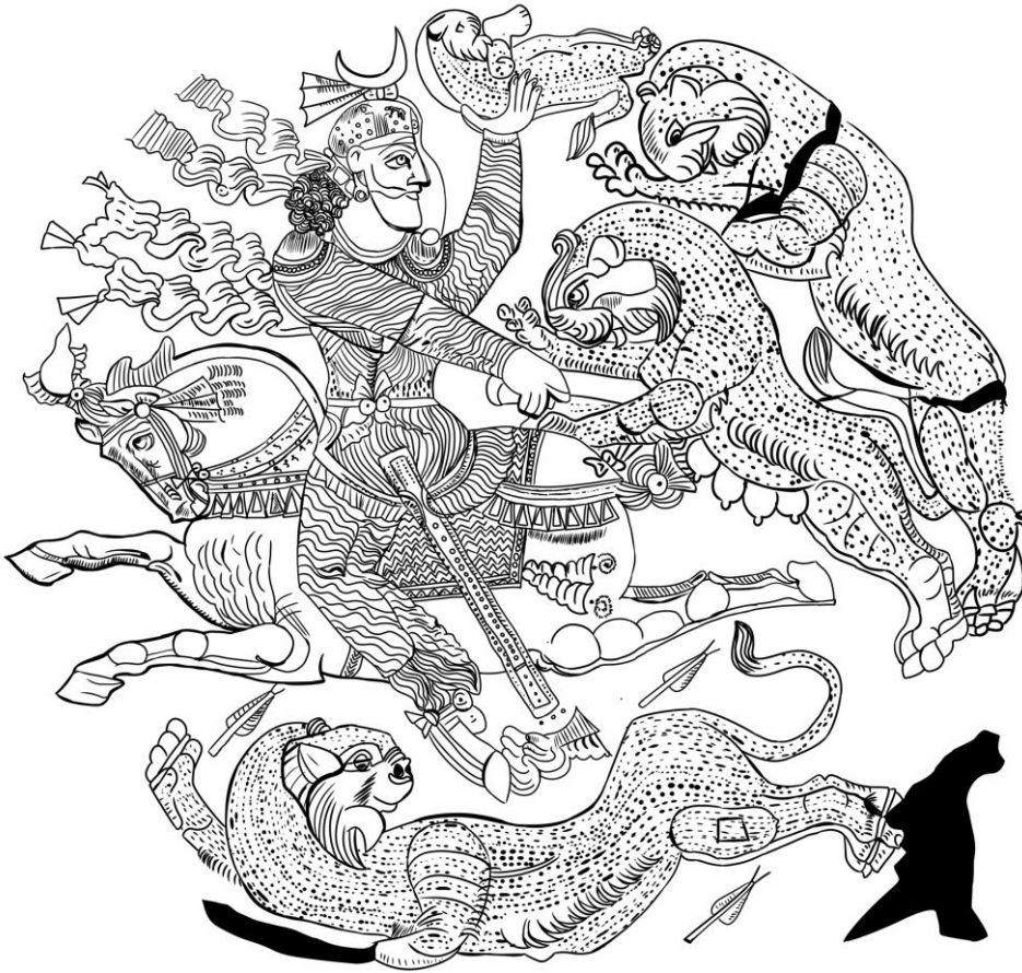
Fig. 13. Sasanian silver plate from Mes 'Aynak (drawing by Eleonora Skupniewicz)