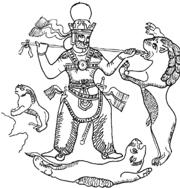
Fig. 7. Plate from Seattle Museum of Arts collection (drawing by Patryk Skupniewicz)