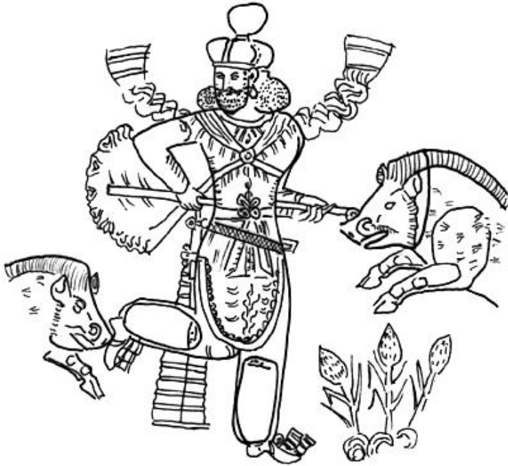
Fig. 8. Plate from Shelby and White collection (drawing by Patryk Skupniewicz)