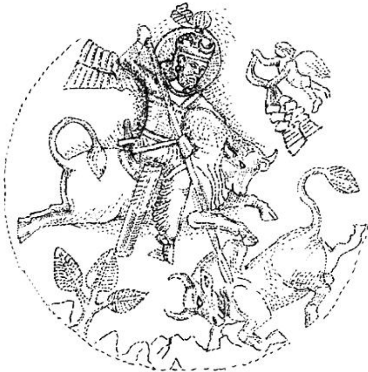
Fig. 12. Sanya Family plate (drawing by Patryk Skupniewicz)

Oblique, downwards position of the boar finds no clear precedence either. The boars are depicted either as protomes, or just parts popping out from the thicket, sometimes diminished to fit the field, or in whole, sometimes jumping towards the hunter. As said earlier – ‘Parthian’ plate from al-Şabāḥ Collection is another exception. The only representation of oblique stretched bodies of the boars is the dead prey on one of the panels in Tāq-e Bostān but than they are clearly separated from the heroic hunter. On one of the hunting scenes on the bowl from British Museum 49 one of the boars is shown directed downwards with his body stretched parallel to another boar jumping upwards. Probably the only analogy of the formula applied in the central medallion of al-Şabāḥ plate would be the ivory plaque from Nimrud where the defeated griffon was placed diagonally with the head downwards. The difference is that on Nimrud plaque the direction of the victim emphasizes diagonal direction marked by the spear of the warrior so it works opposite than in al-Şabāḥ plate. Also, necessity to turn the prey’s head towards the hunter which results with dynamic twist of the beast’s neck in Nimrud plaque, in al-Şabāḥ ends in awkward combination of diagonal body and upwards direction of the mouth. The head of the boar with wide open mouth and huge low tooth is unparalleled in Sasanian art.