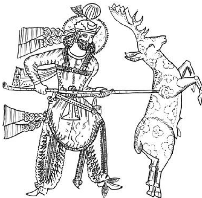
Fig. 4. Yazdagerd killing a stag from the plate from Mertopolitan Museum of Arts collection (drawing by Patryk Skupniewicz)