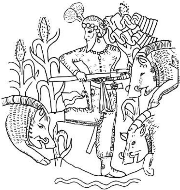
Fig. 9. Plate from the tomb of Feng Hetu (drawing by Patryk Skupniewicz)