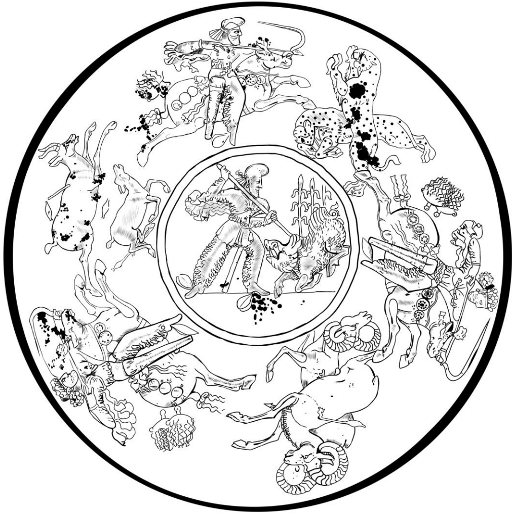
Fig. 1. The plate from al-Şabāḥ Collection (drawing by Eleonora Skupniewicz)

and recognizable criteria 7 . This phenomenon reinforced the conservatism of the Sasanian art and stemmed the survival of the iconographic elements over centuries even long after the fall of the empire. The longue durée and the limited number of the fixed formulae of Sasanian art indicates their quasi-canonical nature 8 . This indicates that the violation of the visual principles in Sasanian art is rather unlikely within the frames of current knowledge 9 . Current paper aims in highlighting the discrepancies between the plate from al-Şabāḥ collection and the decoration of the Sasanian or Sasanian-related toreutics.