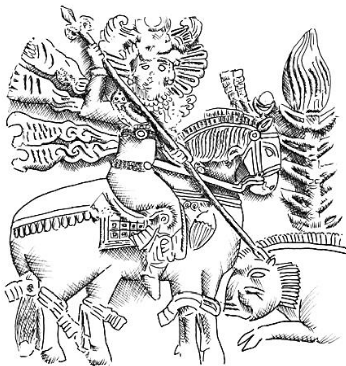
Fig. 10. Hunting scene from Chal Tarkhan stucco frieze (drawing by Patryk Skupniewicz)