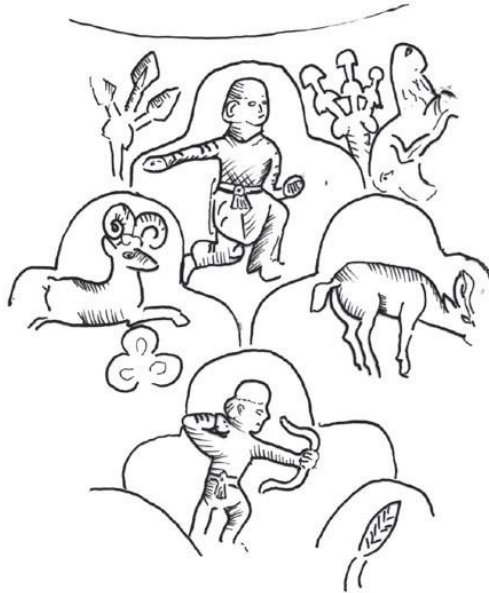
Fig. 2. Hunters from Teheran Museum vase (drawing by Patryk Skupniewicz)

the sequence of lion and tiger hunt scenes on its outside 29 . Instead of central medallion it contains a rosette. The last object that might serve as an analogy for the general composition of al-Šabāḥ Collection plate is peculiar bowl from David Collection in Copenhagen [Inv. No. 2.1984] which contains the mounted hunting scenes in Sasanian style on its exterior, it is dated to 4 th century 30 .