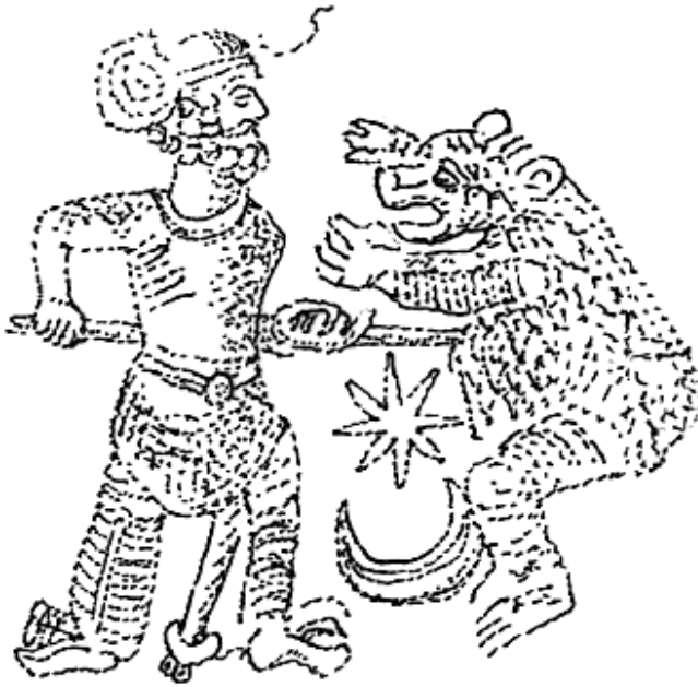
Fig. 6. Seal impression from M. Foroughi collection (drawing by Patryk Skupniewicz)