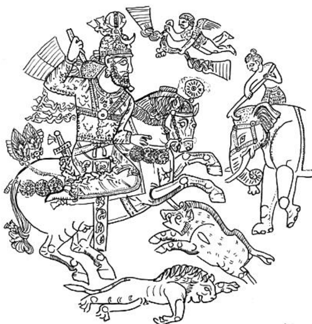
Fig. 11. Scene from Bastis collection plate (drawing by Patryk Skupniewicz)