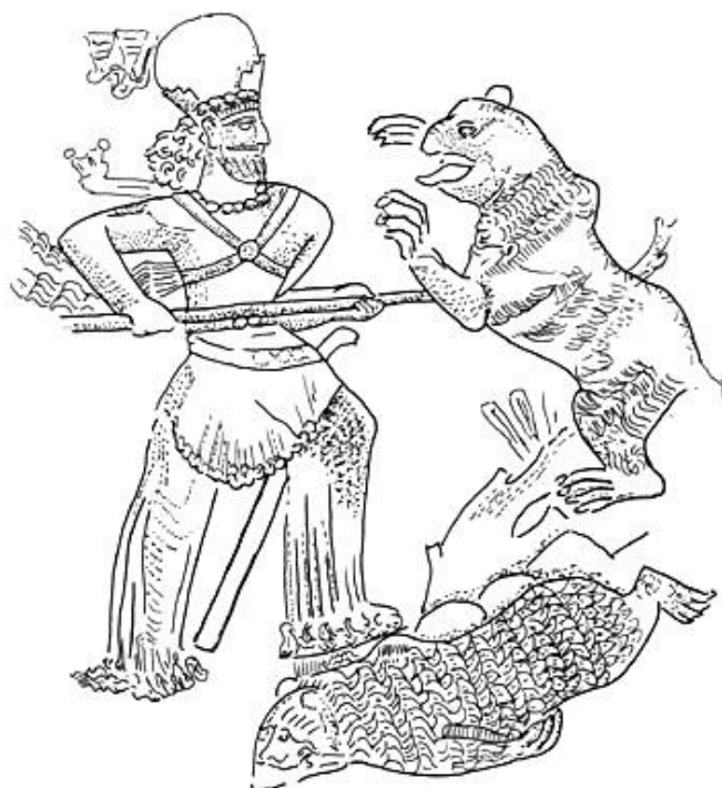
Fig. 5. Šāpūr II fighting bears from Shogakukan collection (drawing by Patryk Skupniewicz)