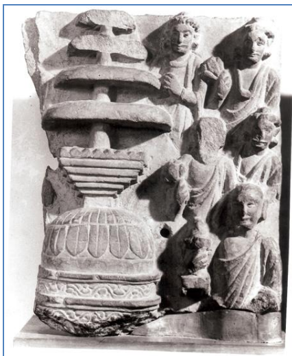
Fig.2. Acc. No. 48.3/44 National Museum, New Delhi

The etymology of the term “Gandhāra” is derived from Sanskrit word Gandhā, which means perfume and it is assumed that valley was blooming with flowers. Other meaning of Gandhā in Sanskrit is red lead, and it was important ingredient of beautifying product of makeup for women; which was mainly produced in Persia and imported via Gandhāran silk routes to India and Mediterranean. Gandhāra is also mentioned in Rigveda, a 7th century BCE text, which describes the ‘fat tailed sheep’ coming from Gandhāra region. Buddhist scriptures, Anguttara Nikaya counts Gandhāra as one among solas janapadas (sixteen Janapada), divided on the basis of people lived in the region. According to Mahāparinibbana Sutta, one tooth relic of Buddha went to Gandhāra. Hindu texts, Mahābhārata and Puranas mention this place as well. Behistun inscription of Darius I mentions this region as part of Persian Achaemenid Empire from where the supply of Yak-wood was imported. According to Herodotus - Darius I appointed Skylax (a Greek captain) to explore the lower reaches from Kabul river down to Indus in the South (Peshawar). Herodotus we learn a set of names of