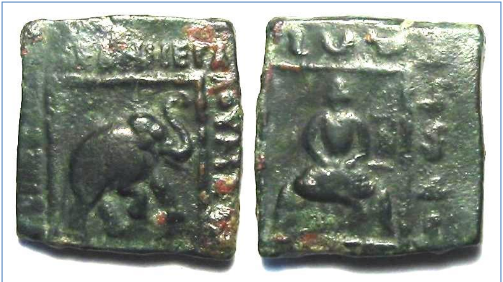
Fig.3. Indian-standard coin of King Maues (80–65 BCE). The obverse shows a rejoicing elephant holding a wreath, symbol of victory. The Greek legend reads ΒΑΣΙΛΕΩΣ ΒΑΣΙΛΕΩΝ ΜΕΓΑΛΟΥ ΜΑΥΟΥ (Great King of Kings Maues). The reverse shows a seated king, or possibly Buddha in Dhyana Mudra. Kharoshthi legend: RAJATIRAJASA MAHATASA MOASA (Great King of Kings Maues). 8