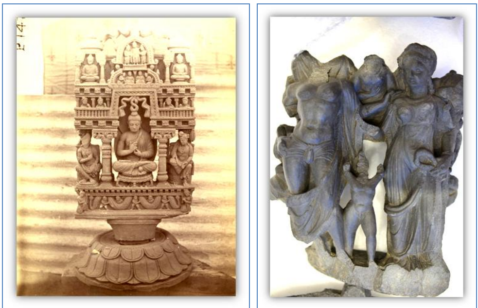
From the left: Fig.4-5. Miracle of Sravasti, Indian Museum, Kolkata, Hariti and Panchika Indian Museum, Kolkata.

The scenes portraying miracles performed by Buddha was to astonish the devotees to learn the nature of Buddha as God and it was the basis of these Semi-Mahayana units that change competed with Brahmanical doctrines of God's having special powers led the Buddhism to increase their numbers of converts .