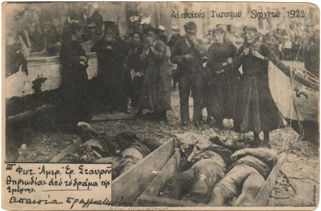
Fig. 3. Scene from the massacre, 1922.