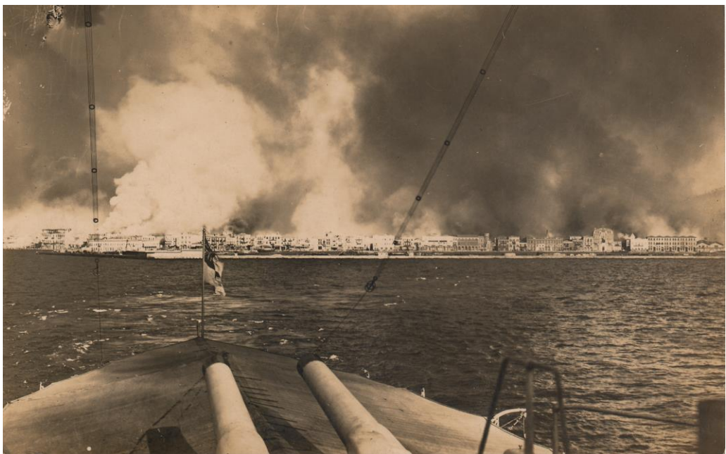
Fig. 2. The arson of Smyrna, 1922 (Armenian Genocide Museum-Institute, s. 13: 1230).