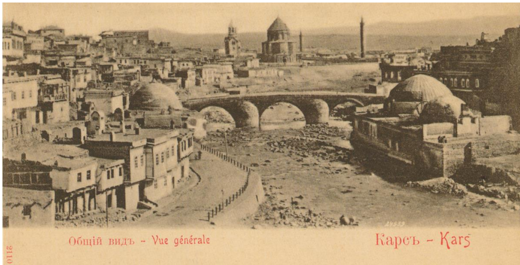
Fig. 1. Panorama of Kars, 19th century.