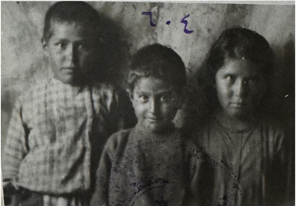
Fig. 4. Armenian orphans from Kars, 1922 (National Archive of Armenia, f. 131, l. 1, d. 102).