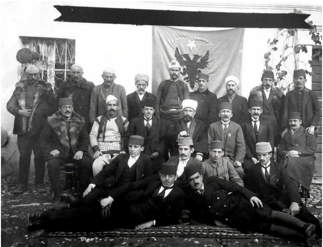
Fig. 1. Committee for the National Defence of Kosovo, 1918. From the book Komiteti "Mbrotjtja Kombëtare e Kosovës" published by the Albanian Academy of Sciences (ISBN: 99943-653-0-4, p. 196)

Kosovo with headquarters in Shkodër. It played a crucial part in protecting and helping displaced Kosovars as well as raising awareness of Kosovo in the world community and the misery that the civilian population in Kosovo was going through as a result of the Serbian invaders.