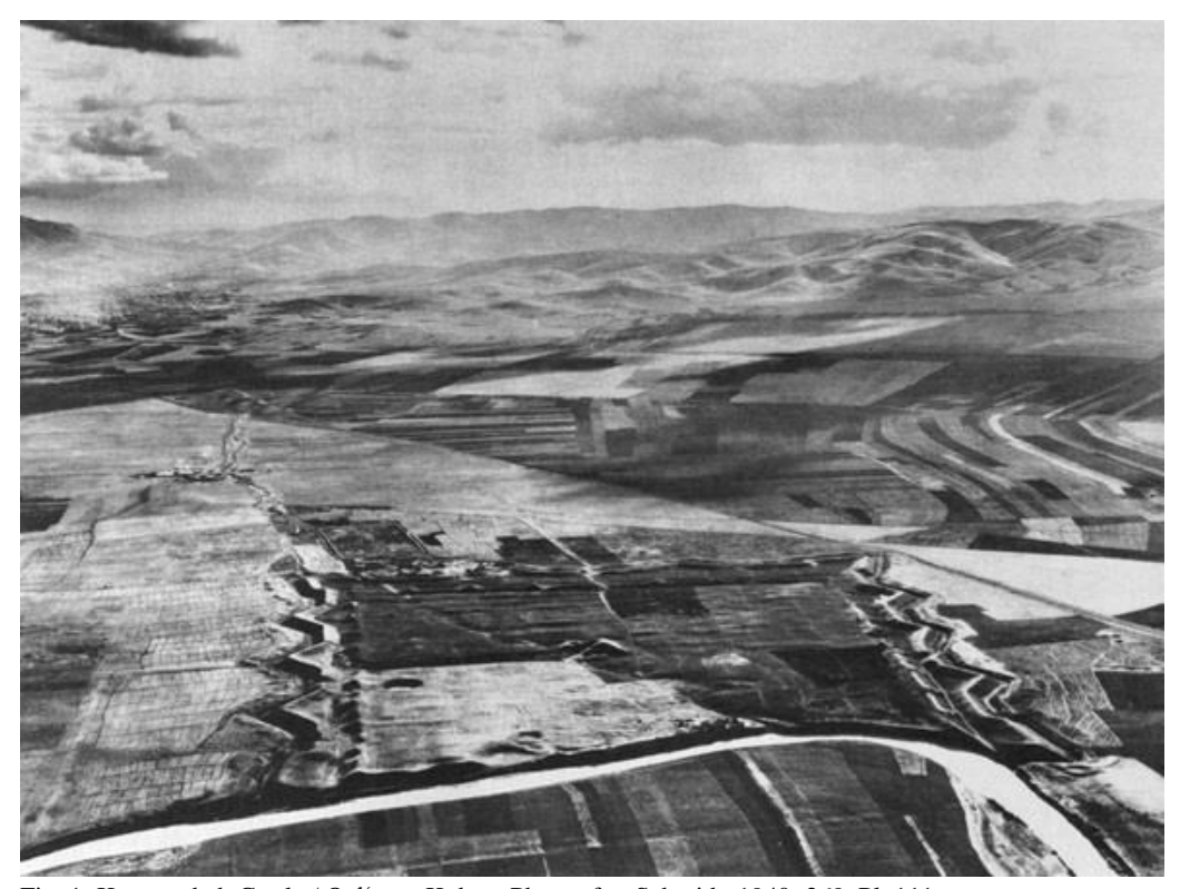
Fig. 1. Kermanshah Castle / Qal a-ye Kohne.

Kermanshah Castle played an important role in the local conflicts and subsequent claimants to the kingdom, due to its ammunition stores, almost entirely non-native (Khorasani) soldiers and survivors of Afsharid rule. The fort's strategic location, close to Eilat Vand, Zandiyeh's main allies, meant that the Zandites took it seriously and maintained regional stability. Despite this, the night attack by the besieging army failed due to the fort's strength and the vigilance of its sentries and gunners. Mohammad Khan Zand launched an unsuccessful attack from three ambushes near the moat during the night, when most of the guards were on leave. The construction of successive and sometimes spiralling trenches with cannons was one of the strategies used to attack the gate of the fort, increasing the range of operations while blocking the defenders' supply routes. For example, Mohammad Khan Zand fired the artillery of the third trench, but the defenders prevented the gate from collapsing by building a similar embankment. The fort, with its long-range artillery, kept the inhabitants' herds at a safe distance for grazing, but night raids by trench gunners often succeeded in confiscating the defenders' cattle and supply convoys, leading to famine. For example,