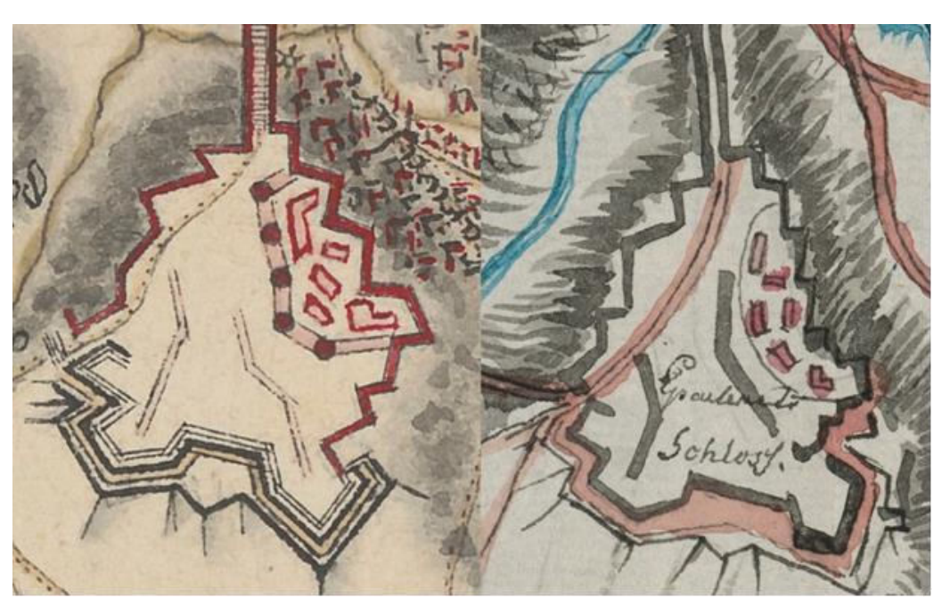
Fig. 3. The New Castle and the Old Castle in Kamianets-Podilskyi in different plans. On the left - a fragment of the discussed plan [BN, ZZK 52 374 A]; on the right – a fragment of the plan kept in Berlin [GStA XI, HA, FPK, G 71097; after Opyrchał, 2019: 42, fig. 14]. Both representations of the Old Castle are very similar to one another and very different from reality.