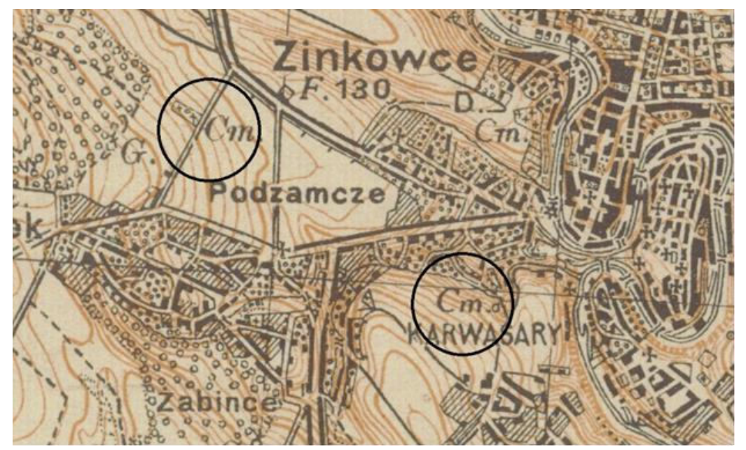
Fig. 2. Cemeteries marked in a map from the year 1930; they were marked in the discussed plan from the year 1773 [BN, ZZK S-21 306 A – a fragment]