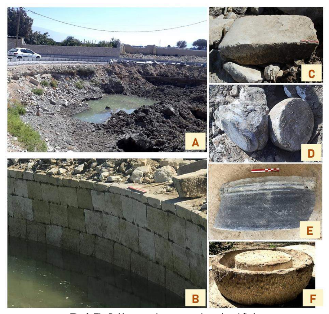
Fig. 3. The Dehbarm pond structure and mentioned finds (photo by A. Askari Chaverdi, summer 2021; illustrated by E. Rashidian)

under the modern village. The outlet is regular in shape and about 2.5 m wide. Currently, less than 100 m of it is visible on the surface.