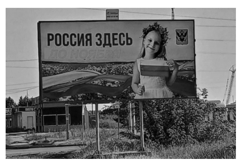
Figure 2. Photo "Russia is here until November"

The gap between the Russian triumphalism and the reality was exploited by the Ukrainians to create another humorous material online. When Kherson was liberated by the Ukrainian army and the Russian army had to surrender the occupied area, the same photo was cynically updated by the Ukrainians: Rossiya zdes do noyabrya (Russia is here until November).