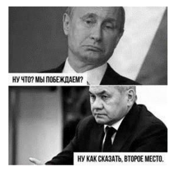
Figure 5. Putin's conversation with Shoygu.

The web was also full of memes and jokes aimed directly at the President of the Russian Federation and his closest associates, pointing out their stupidity, cowardice, or alcoholism. For example, such a joke mocking Russia's defeat began to circulate on social media: "Putin to Shoigu, Russia's Minister of Defence: 'Have you taken all of Kherson?' Shoigu: 'No, just Kher for now.'" ('kher' meaning 'dick' in Russian)<sup>13</sup>.