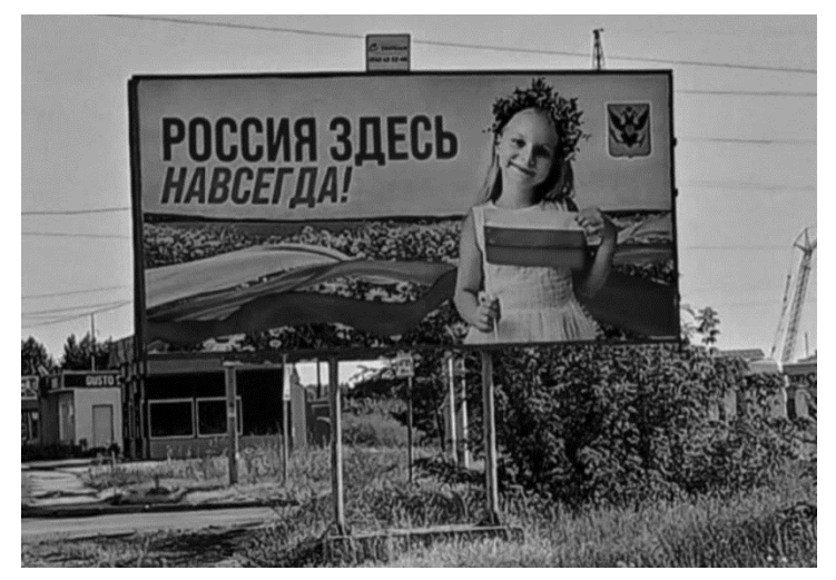
Figure 1. Billboard "Russia is here forever"

The gap between the Russian triumphalism and the reality was exploited by the Ukrainians to create another humorous material online. When Kherson was liberated by the Ukrainian army and the Russian army had to surrender the occupied area, the same photo was cynically updated by the Ukrainians: Rossiya zdes do noyabrya (Russia is here until November).