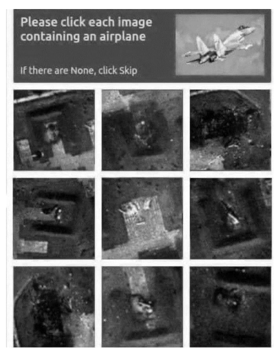
Figure 7. Russian aircraft destroyed

shared the warning from the World Health Organisation that 'smoking kills'. Another tweet (Figure 7) included a mosaic of photographs of burnt aircraft with instructions that read, 'Prove you are not a robot: Please click each image containing an aircraft. If there are none, click Skip'<sup>17</sup>.